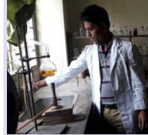
Distillation of the Sample