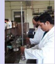
Determination of Volatile Acids by Volumetric method