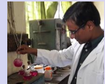
Sample undergoing Reflux on a water bath for determination of Esters