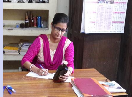
Report Preparation and final submission