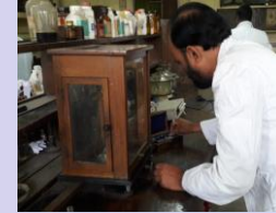
Determination of Specific Gravity of the sample