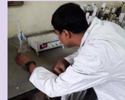
pH Determination using pH meter